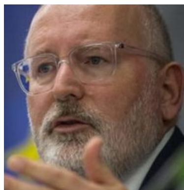
Commission Vice-president Frans Timmermans