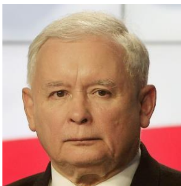
Party chairman (PiS) Jarosław Kaczyński