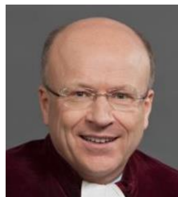
President European Court Koen Lenaerts