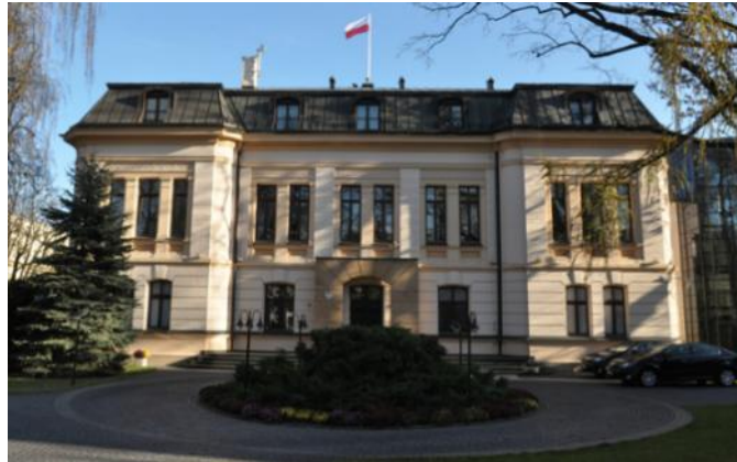
Poland's Constitutional Tribunal: 15 judges