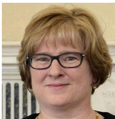
Irish High Court judge Aileen Donnelly